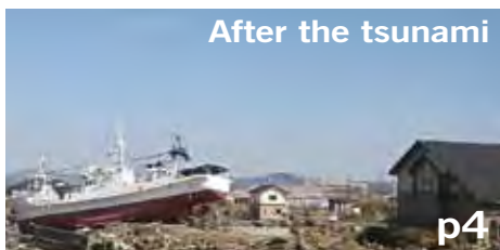
After the tsunami

many sparks one fire many stories one history many dreams one vision